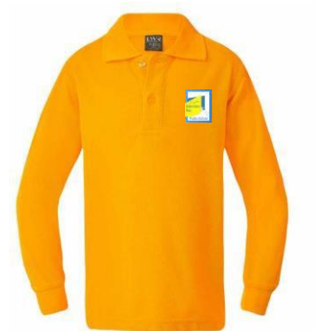
Long sleeve polo