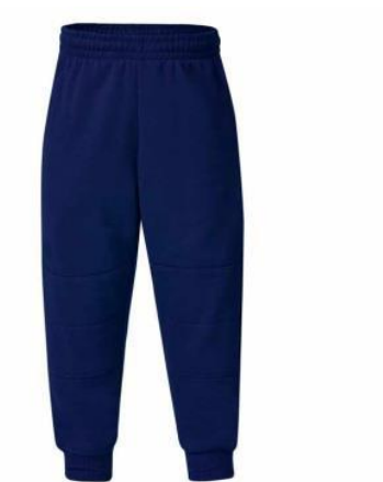
Double knee track pants