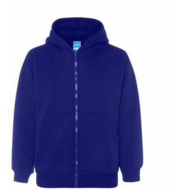
Hoodie with zip