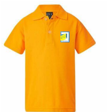
Short sleeve polo