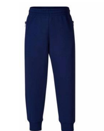
Fleecy track pants